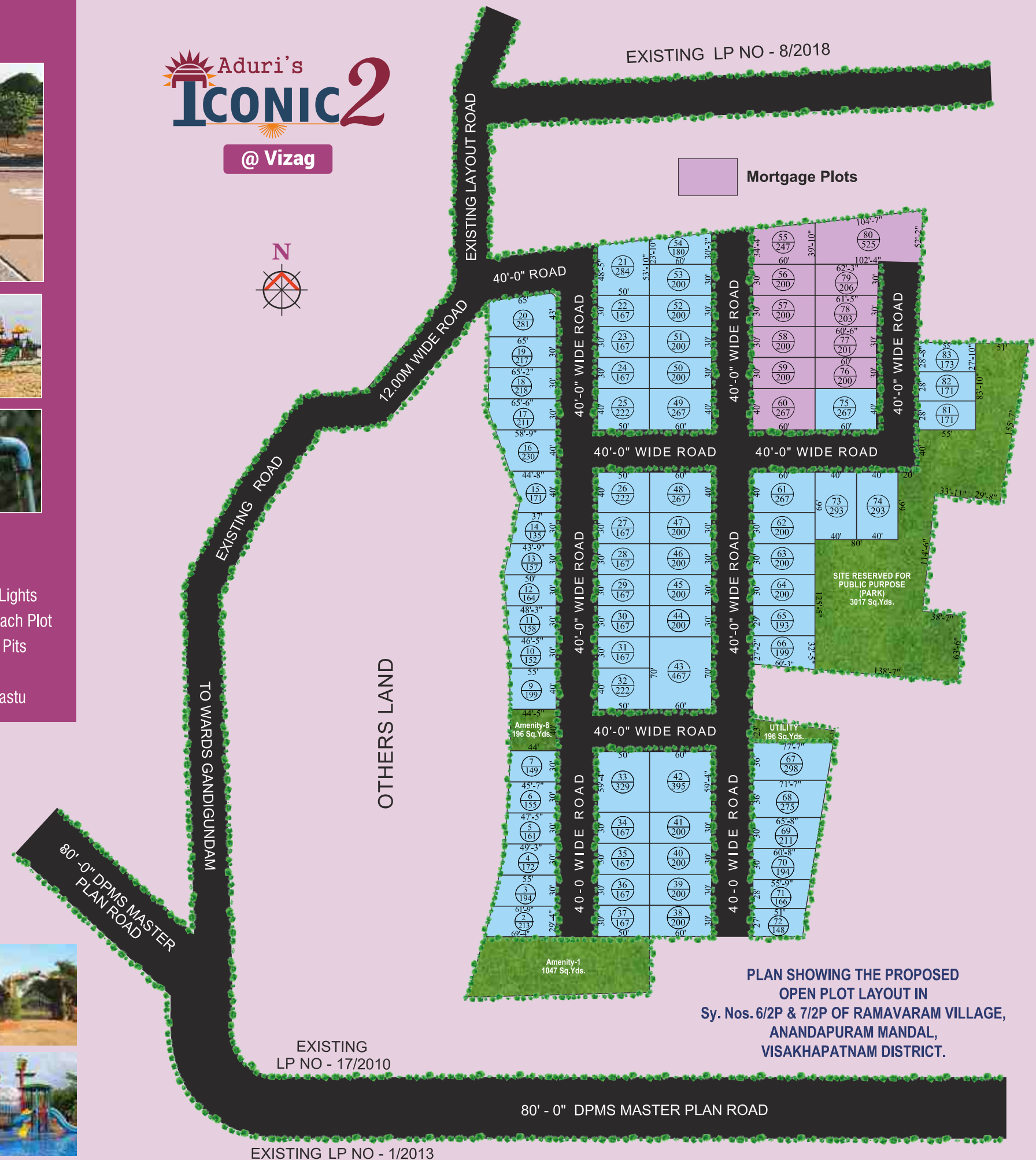
PLAN SHOWING THE PROPOSED OPEN PLOT LAYOUT IN Sy. Nos. 6/2P & 7/2P OF RAMAVARAM VILLAGE, ANANDAPURAM MANDAL, VISAKHAPATNAM DISTRICT.